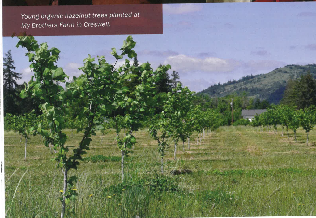
Young organic hazelnut trees planted at My Brothers Farm in Creswell.